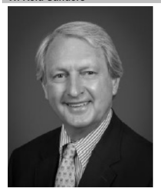
Director since: 2009 Age: 70 Board Committees: Audit, Compensation, Risk Oversight